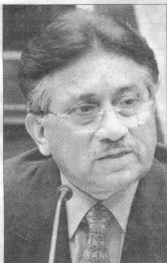
President Perviz Musharraf