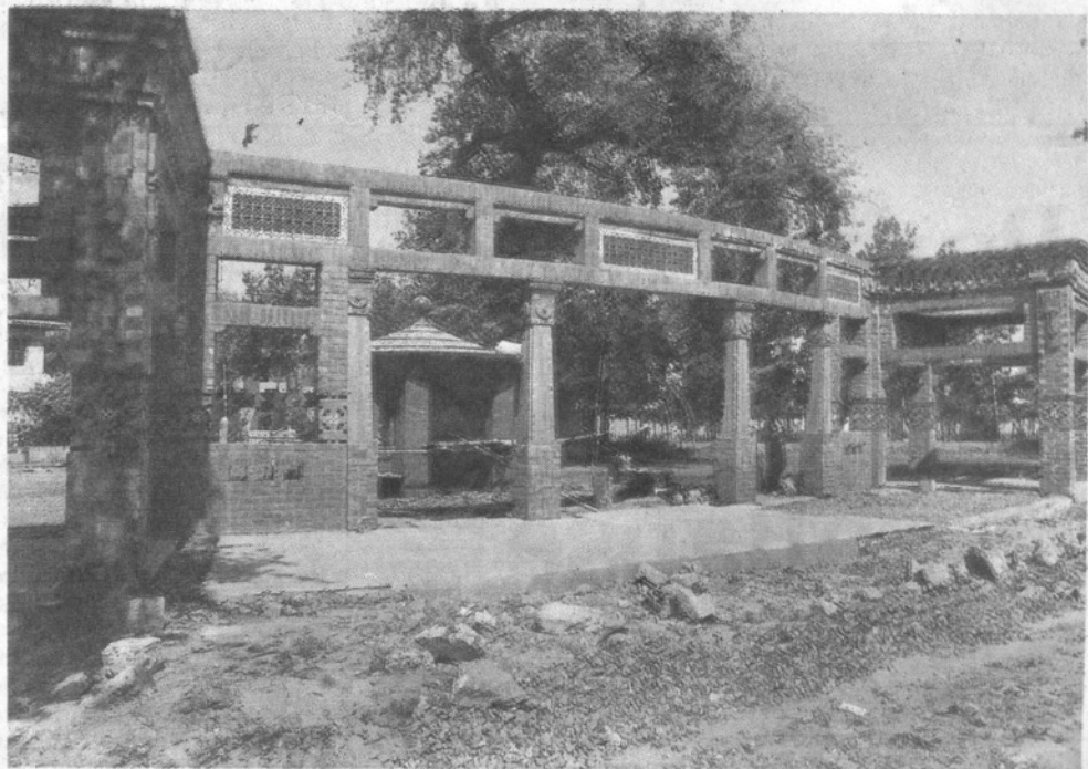
Big walls of new bus-stop hinder the sight of old 'canopy-type' stop.

muters, said a senior official adding that the Daewoo Company had refused to operate its buses in Model Town due to absence of proper bus stops. How-