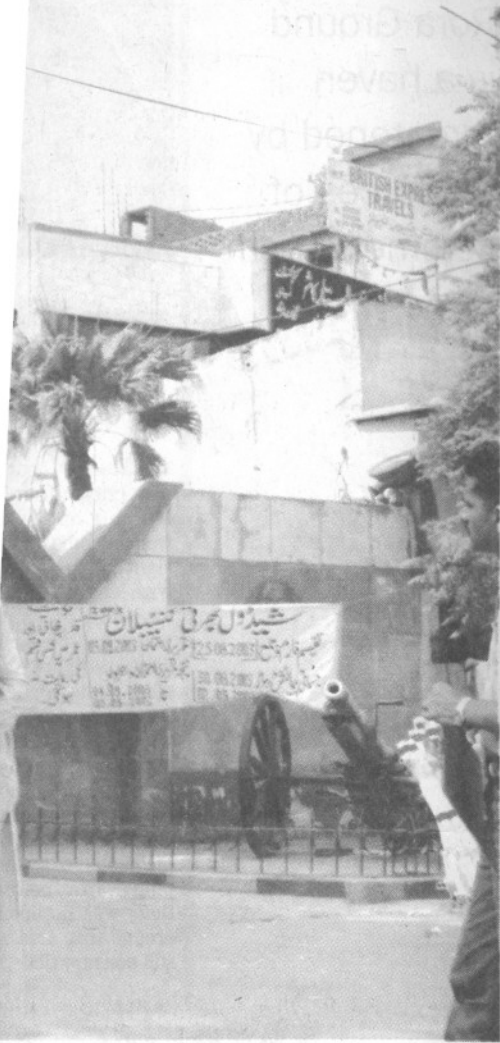
ands of candidates applied for the post.

andidates do not seem the sincerity of the me of them seem to re that a lot of money with a 'waddi sifar- mendment by some- atters) is needed to job. "They are asking )-60,000 rupees per a candidate on the of anonymity, claiming s the 'inside informa- influential ones