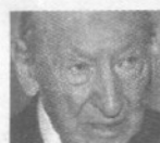
Jun 14 Kurt Waldheim, 88, former UN chief and Austrian president.