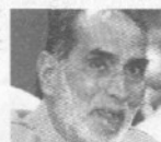
Jul 08 Chandra Shekhar, 80, former Indian prime minister.