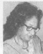
Aug 21 Qurratulain Hyder, 80, celebrated Urdu novelist who received India's highest literary award.

Aug 24 Abdel Rahman Aref, 91, former Iraqi president, who was ousted by Saddam Hussein's Ba'ath party in 1968.