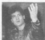
Apr 8 Asad Amanat Ali Khan, 54, famous semi-classical and playback singer.