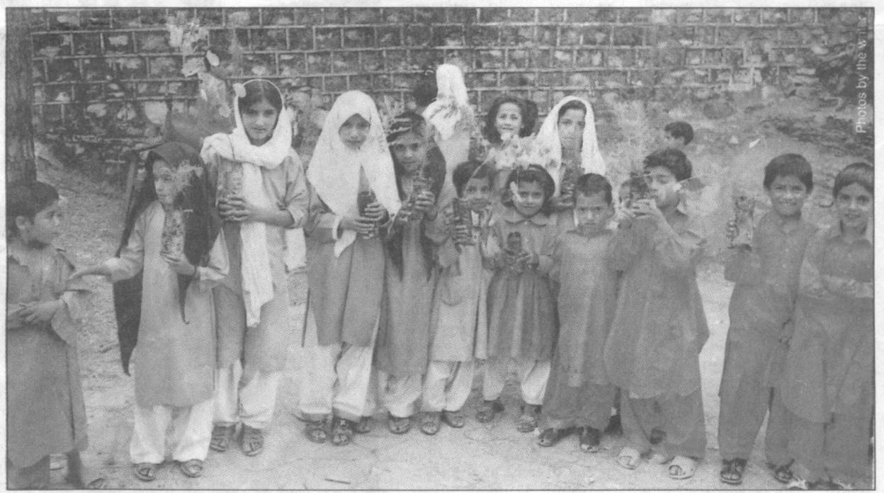
the "However, we realize that Learning to care for plants from a young age

Other organizations, too, are doing their bit for the improvement of Margalla Hills National Park. Unfortunately, some issues especially those of fuel wood cutting and forest fires still need our attention. Through dedication and sincere efforts on the part of everyone, one of the most beautiful national parks of Pakistan and be protected and conserved for the future generations.