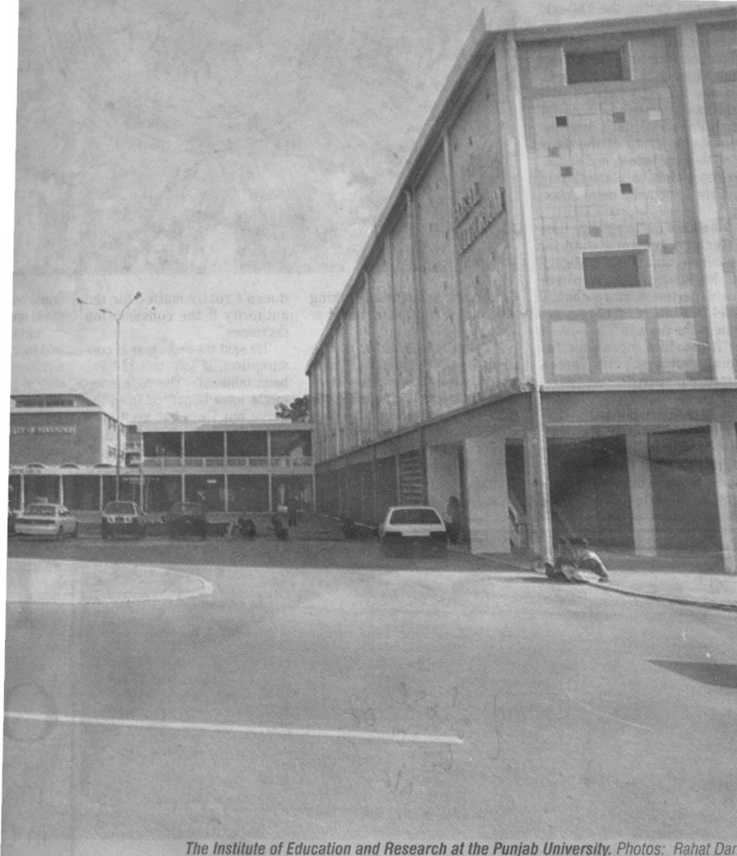
The Institute of Education and Research at the Punjab University.

Commission had recognised M.Ed as equivalent to MA/MSc degrees.