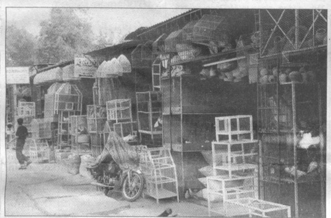
A VIEW of the Dharampura bird market.

The owner of a fish and aquarium shop said all varieties of ornamental fish were being imported from Bangkok. Some fish could be bought for a mere Rs50 per pair whereas others were offered for Rs10,000 per pair. Small aquariums made from 5mm glass measuring up to four cubic feet were fabricated on payment of Rs1,000 per cubic foot. The aquariums made from 8mm glass cost Rs2,000 per cubic foot. The scenery, oxygen pump and shingles were included in the price. Fish meal of Rs50 was enough to maintain eight to 10 fish for two to three months.